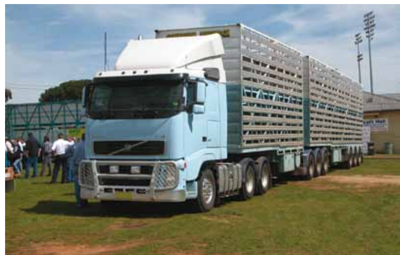
Training in driving high vehicles is essential